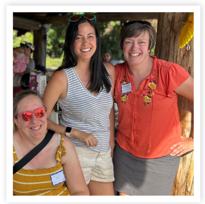
PEPS staff at the LGBTQIA+ family picnic in September.

PEPS Affinity Groups bring together people who share a common identity. These groups can be a place of respite where participants do not have to explain their identity and can show up more fully. We've piloted groups for LGBTQIA+ families, single parents, and working moms. New Affinity Groups are introduced with care and intentionality, taking into consideration the need, the local landscape of organizations already supporting specific communities, and staff capacity.