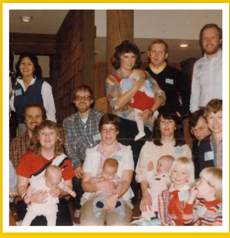
A PEPS Group gathering in 1984.