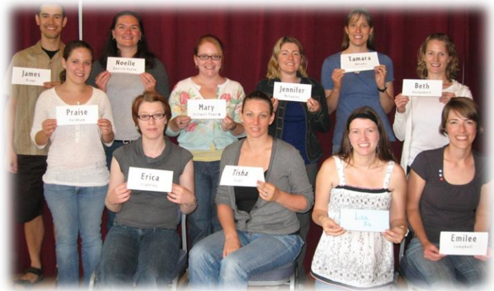
Monthly PEPS Group Leader Training 2009