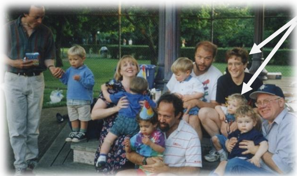
My PEPS Group 14 years ago...

I was fortunate to join PEPS as the Executive Director in July of 2009 at a time of financial strength, serving nearly 2000 parents through our Newborn program and another 240 parents through our new Little Peppers and Baby Peppers programs.