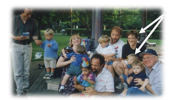
My PEPS Group 14 years ago...

I was fortunate to join PEPS as the Executive Director in July of 2009 at a time of financial strength, serving nearly 2000 parents through our Newborn program and another 240 parents through our new Little Peppers and Baby Peppers programs.