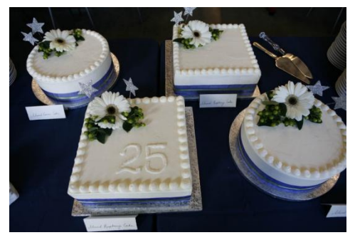
We had some cake and ate it too!

Thank you to all the guests, our Luncheon committee and Luncheon Chairs, Table Captains, Luncheon Challenge Donors and Luncheon Sponsors who made it possible for us to raise over $135,000 for PEPS' programs.