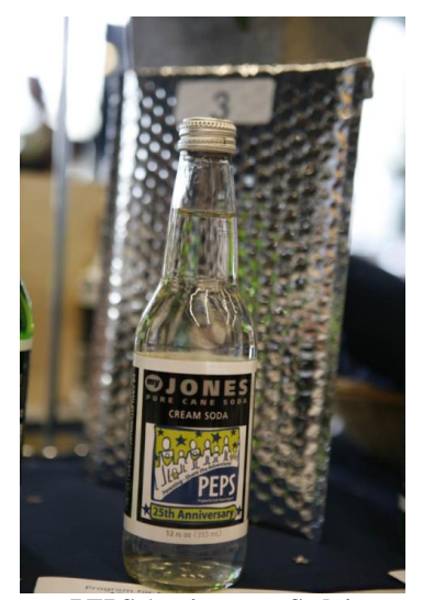
PEPS Anniversary Soda!