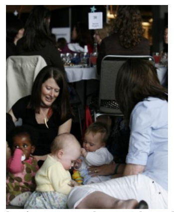
Babes in arms are always welcomed!