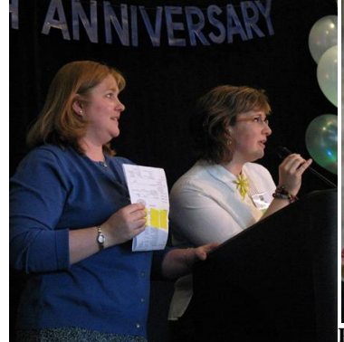
XPEP 5 X