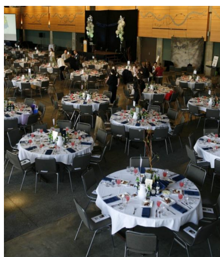
Seattle Center Fisher Pavilion