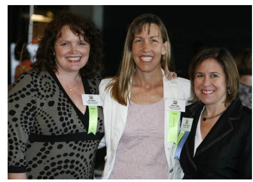
Longtime Table Captains & Supporters