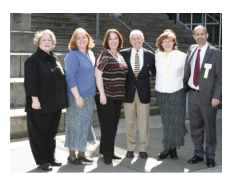
PEPS Luncheon Speakers